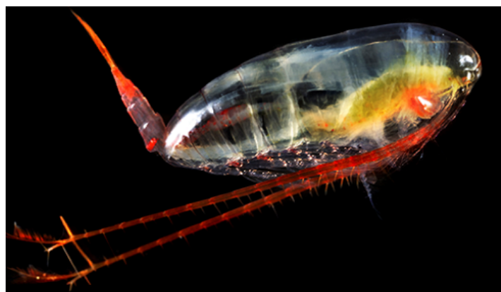
Close-up of Calanus finmarchicus

From this vast renewable supply, only 0.0005% is carefully and responsibly harvested to produce Zooca® Calanus® Oil . The product is certified by both MarinTrust and Friend of the Sea, reflecting its compliance with rigorous sustainability and environmental standards.