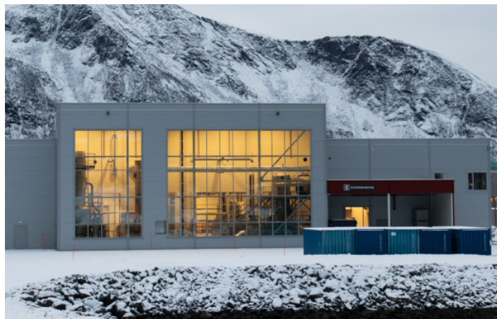
Factory in Winter

© 2026 Any information or recommendations made for use of Seller's materials do not affect in any way Buyer's obligation to examine and/or test the Seller's goods with regard to their suitability for Buyer's purposes especially with regard to consumer use. No information given by the Seller is to be construed in any way as a guarantee regarding characteristics or duration of use, unless such information has been explicitly given as a guarantee. Any information given on the website is only applicable to the ingredients supplied by Seller and it is Buyer's obligation to ascertain how to advertise and label products containing the ingredients towards the final consumer.