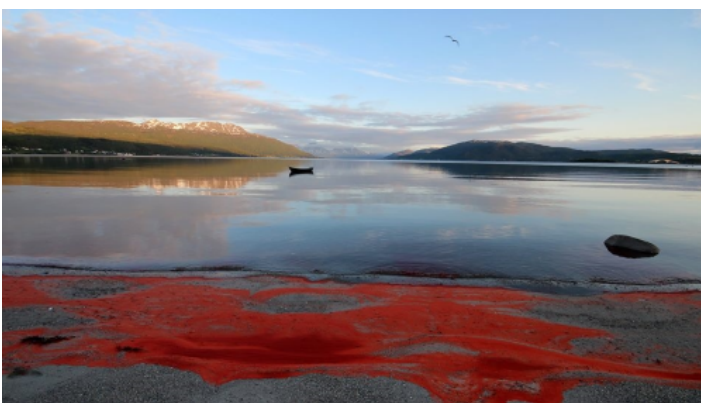
Calanus finmarchicus flushed ashore